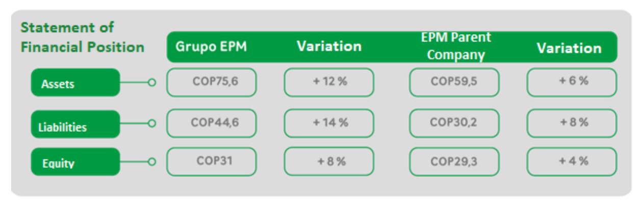
Figures in COP billion

EPM received dividends for COP 580 billion, of which 85% came from the subsidiaries, and the rest by non-controlled companies.